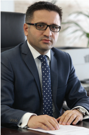
Deputy Prime Minister for European Affairs Mr. Fatmir Besimi, PhD